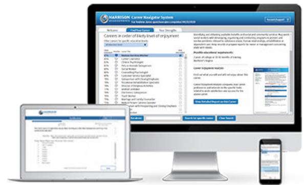
Online Interactive Career Portal